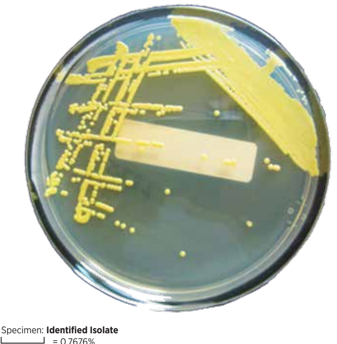
TABLE 1. Environmental Isolate Plate Streak and DNA Sequencing Results.

tion relying on the ITS or D2 region. Sequencing is more specific and identifies more samples to species and strain than phenotypic based methods or MALDI-TOF.<sup>10,12</sup> Because the DNA sequence of an organism is not dependent on growth stage, conditions, or media, sequencing approaches can be more robustly applied, even enabling identification of isolates that have ceased growth. The cost of identification can be considerably higher than that of other approaches. However, DNA analysis remains the approach that is most likely to produce identification to the species level and the least likely to produce an incorrect identification. Table 1 shows the colony morphology of Micrococcus luteus in comparison to the phylogenic tree